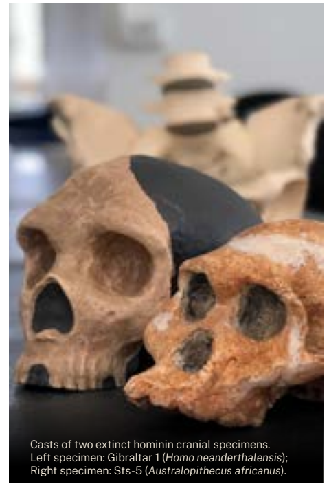
Casts of two extinct hominin cranial specimens. Left specimen: Gibraltar 1 ( Homo neanderthalensis ); Right specimen: Sts-5 ( Australopithecus africanus ).